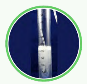
Foam control during aeration after Dfoam added