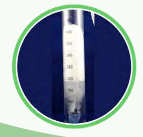
Foaming before addition of Dfoam

The recommended dosage level is up to 0.5%.